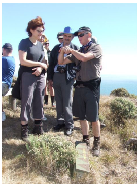
Checking out the locals

While much of this may have been nothing new to the longer serving members of FOMI, it was a great introduction for those of us new to the organisation. The opportunity to see some of the wildlife was also valuable. Several of the bird species introduced to the Island were in evidence: North Island robins, kakariki, brown teal, takahe and the recently translocated shore plover. Occupants of the 'lizard lounge' also provided a talking point.