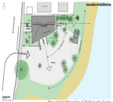
Mana Visitor/Education & BioSecurity Centre