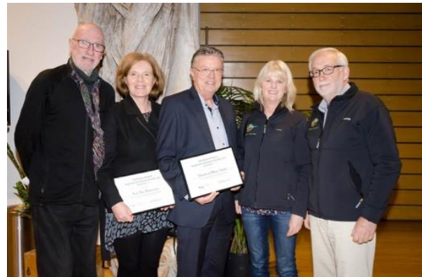
Wellington Airport Regional Community Awards, Porirua awards night, with FOMI present and past executive.