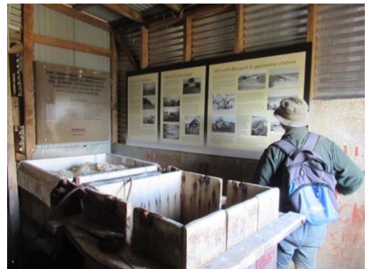
New panels with historical information were installed by FOMI in the woolshed.