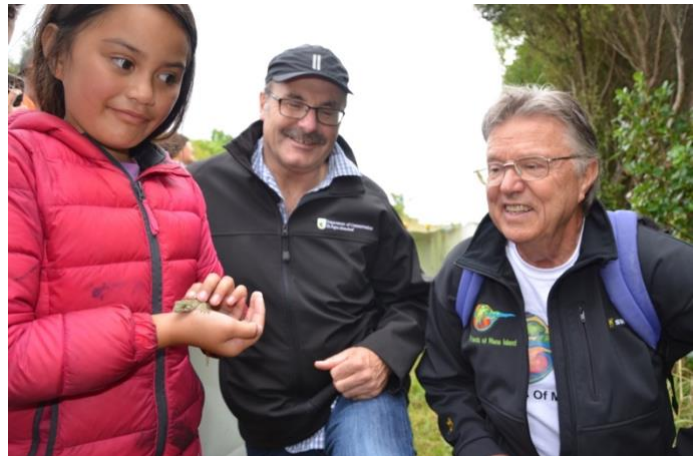
The Ngahere gecko translocation in March was a special occasion with representatives from iwi, DOC and FOMI releasing the gecko.