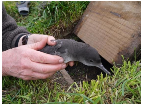
A fluttering shearwater being returned to its burrow.