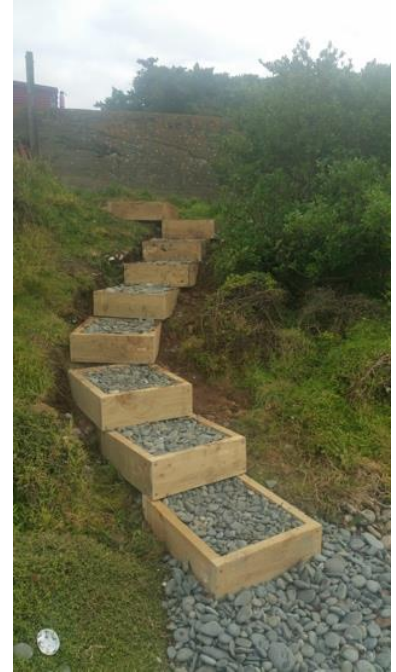
New steps from beach to woolshed.

These dog searches are an integral part of the island biosecurity system, as there are numerous ways that a pest could potentially reach the island. Having far flung corners checked by these dog handlers helps to make sure that not just the 'easy to reach' parts of the island are being routinely surveyed.