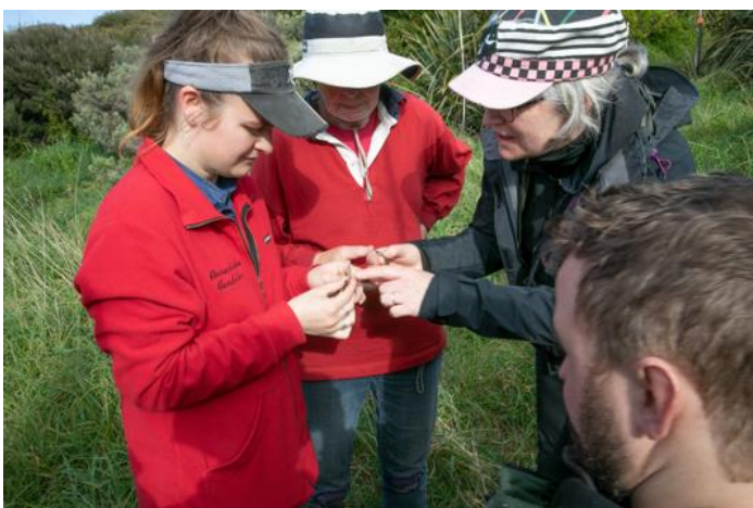
Identifying skinks in pitfall traps, October trip.

August trip - It was all hands on deck on Saturday morning to move 80 waratahs, pitfall pails and cups, 20m of downpipe pipe, cows' ear tags, and tools uphill to the site of the mature flax trial site. Amazingly everything was on site by 10am. A huge effort by all! The reason for our volunteers to carry this – the quad vehicle was out of action.