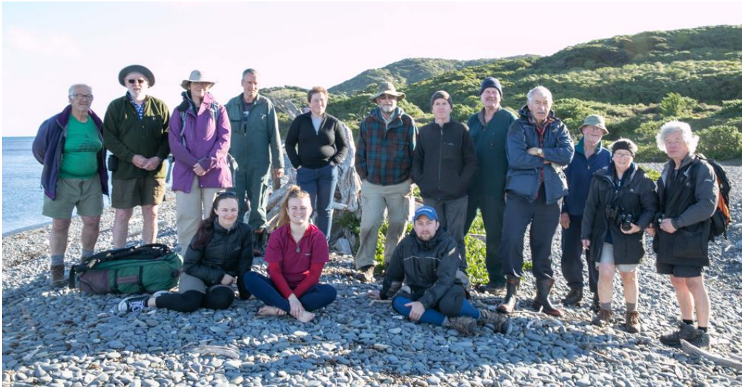
Working bee volunteers on the August trip.

August trip - It was all hands on deck on Saturday morning to move 80 waratahs, pitfall pails and cups, 20m of downpipe pipe, cows' ear tags, and tools uphill to the site of the mature flax trial site. Amazingly everything was on site by 10am. A huge effort by all! The reason for our volunteers to carry this – the quad vehicle was out of action.