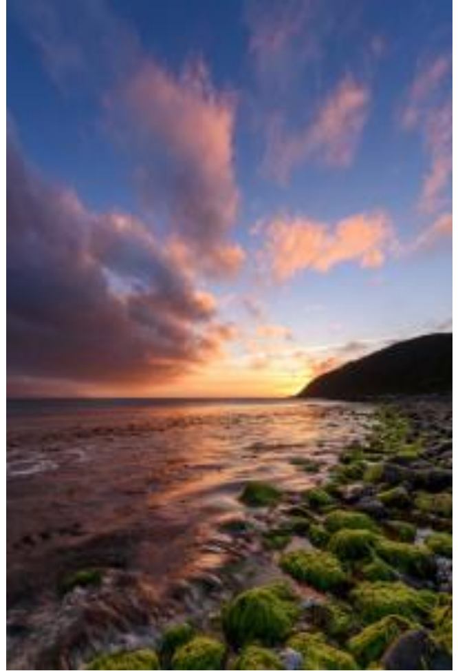
Winner of the landscape category was Leon Berard with this photo called Sunset from Hole in the Rock Track.