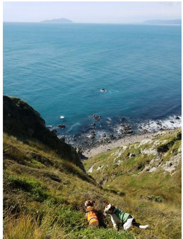
Pest detection dogs on Mana Island. Nothing found!