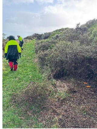
Tirohanga NW Trig track

On returning to the Lockwood, Colin and Steve Rowell inspected the wetlands system. All the ponds were full to overflowing, in stark contrast to the previous work party on 11 – 13 April, when there was no water in any of the ponds. The high-water levels made it difficult to access some of the pond inlets and outlets. There was also a significant flow from Pond G to pond J via a channel that had not been documented previously.