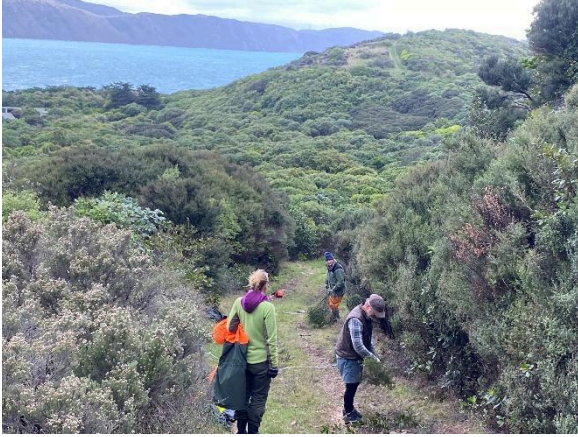
No access track widening