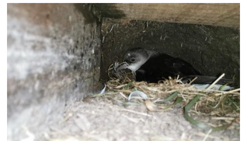
Fluttering Shearwater in its burrow

Shearwater site. They found 36 Fluttering Shearwaters in burrows and could see that some birds were sitting on eggs. They also checked the Cook's Scurvy Grass propagation site and found that many seedlings had been nibbled. The suspects were pukeko or takahe. At the White-faced Storm Petrel site they cleared burrow entrances in pouring rain but had a moment of sunshine for their lunch.