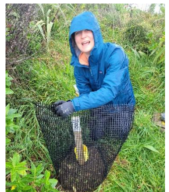
Brie and new netting to protect Cook's Scurvy Grass