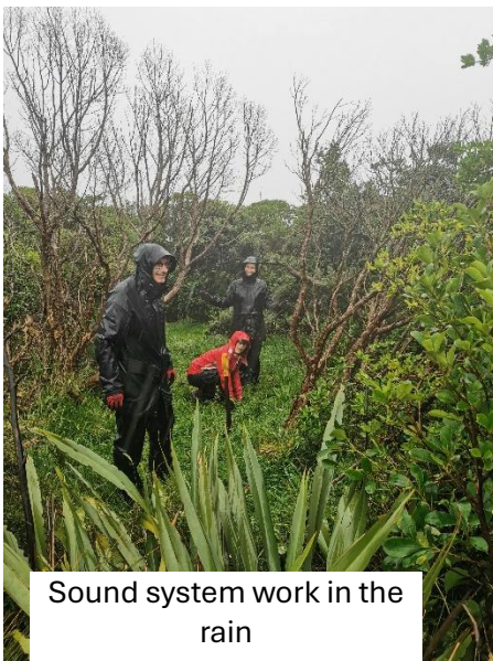
Sound system work in the rain